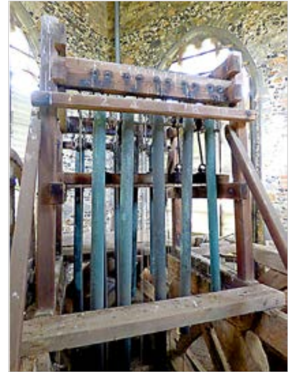
The tubular bell frame pictured before the Tower restoration work

This is a once in a lifetime opportunity to contribute in a very practical and