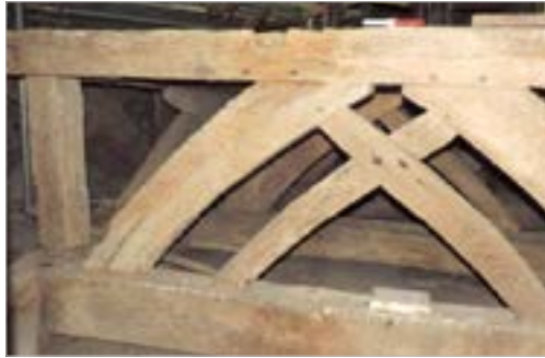
The Oak frame of the bell chamber

Following the completion of the All Saints' Church Tower project we are planning to restore the bells so that once again they can be rung to announce services, weddings, funerals and during the communion service.